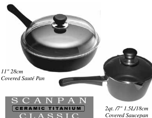
11" 28cm Covered Sauté Pan