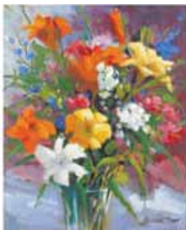
Lilies O/C 20x16 $1,000