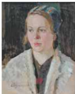
Portrait of a Woman by Tumakov O/B 15.2x11.7 NFS