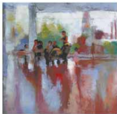
Dancing Light O/C 48x48 $6,500.