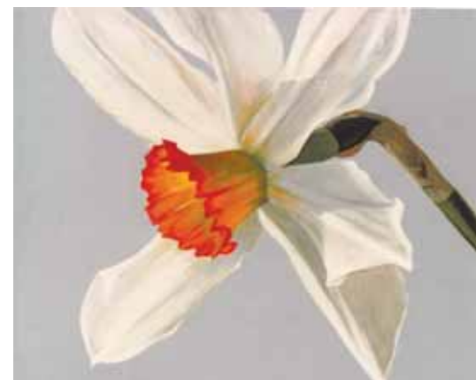
Figure 2 Spring Daffodil by Comer Jennings. Another dramatic spring flower to be a part of the Tabby and Tillandsia Garden Walk Weekend. Comer epitomizes drama in his artwork.

be in the form of portraits, still lifes or contemporary modern masters. This is what makes a room sing.