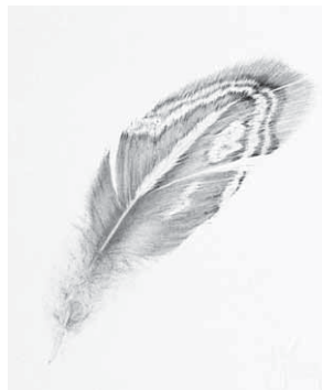
Ring Necked Rump Feather