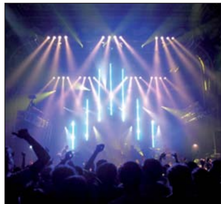
Sound Tribe at The Tabernacle in Atlanta. — received 2:15: a.m., April 26

"Sorry about your leaving Cody you are down to Earth" — received 4:42 p.m., April 25