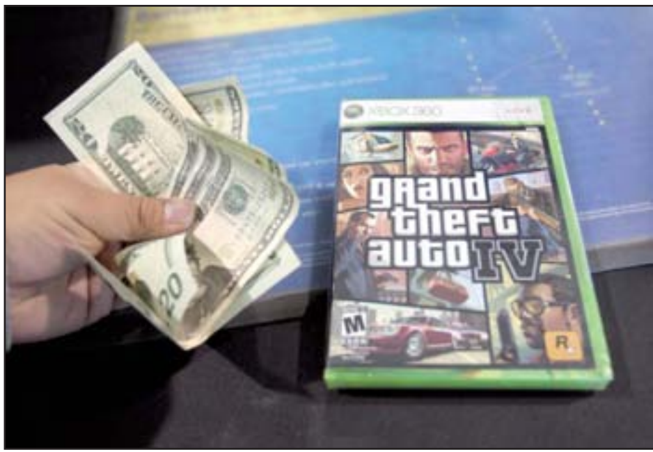
A Best Buy customer pays cash to purchase the game Grand Theft Auto IV in Mountain View, Calif. The long-awaited title from developer Rockstar Games was released on Tuesday.