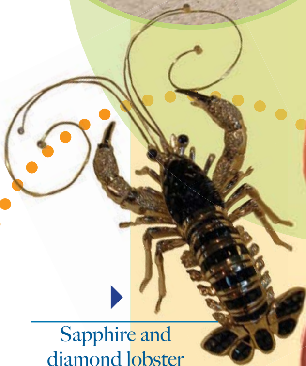
Sapphire and diamond lobster brooch at Redfern Jewelers, St. Simons Island