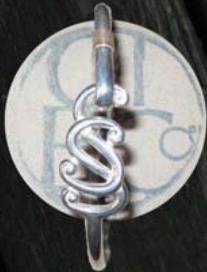
St. Simons bracelet at Golden Isles Bracelet Co., St. Simons Island