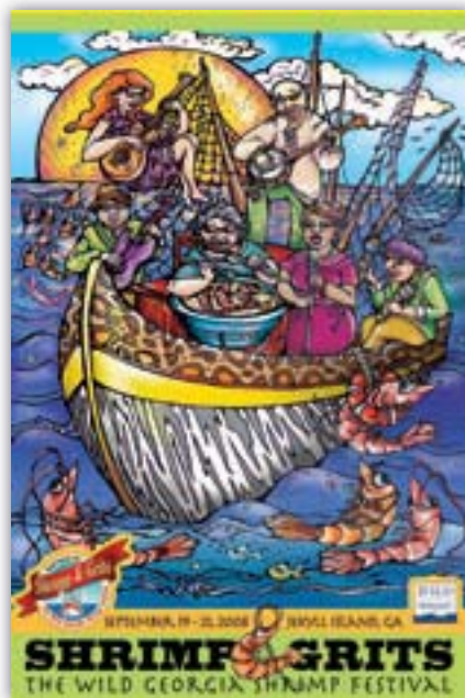
September 19-21, 2008 • Jekyll Island, GA

Chef Rob Sartorio of the Jekyll Island Club Hotel holds a Northern California Flair themed Chef's Demonstration that includes two courses with generous tastings and printed recipes at 1:30 p.m. Details: www.jekyllclub.com