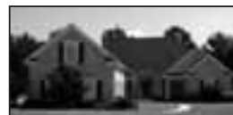
137 CHINQUAPIN $399,900, CALL DANA SMITH