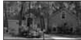
104 DUNKIRK LANE, $417,500, GREG MCCLOUD