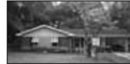
546 CARTERET ROAD, $144,000, CALL MISTY RUEFF