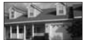
211 PEPPERTREE, $219,500, CALL DENESHA HOPE