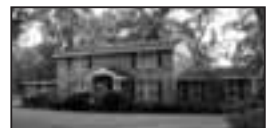
147 KING COTTON ROW, $297,500, CALL PAT DEASON