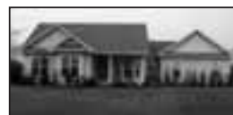
119 SPRING LAKE $289,900, CALL DAVID GUYNN