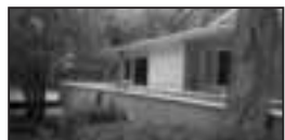
611 EXECUTIVE GOLF VILLA, SSI, $206,150, CALL CHERI HATALA