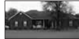
2160 CHARING CROSS, $279,000, GREG MCCLOUD