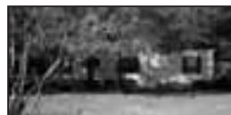
633 RIVERSIDE DRIVE, JESUP, $77,500, CALL REGINALD LEE