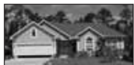
113 HICKORY, $336,000, CALL DELL KNIGHT