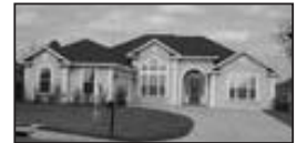
213 LIBERTY SQUARE, $239,000, JOE GASKA