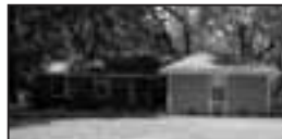
101 MARSH OAK DRIVE, $188,475, CALL JOE GASKA