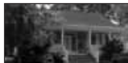
114 SEASIDE CIRCLE, $565,900, CALL LEE DOBSON