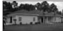
300 BUCK SWAMP ROAD, $426,000, GREG FARNELL OR DANA SMITH