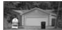
110 MUSGROVE SSI, $292,000, CALL LEE DOBSON