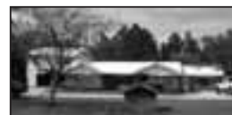
RT. 2, BOX 70 C.D. AVENUE $230,000, CALL DANA SMITH OR GREG FARNELL